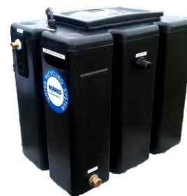
91 Litre Header Tank