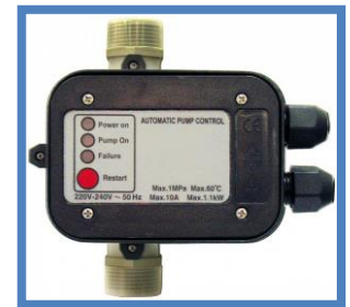
AMCU Control Unit